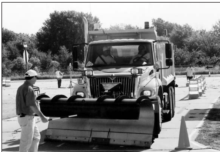
Chris Ford, District 5, prepares to measure the distance between the toe of the blade and the stop bar as this team completes the final obstacle on the Snow Rodeo course. On this obstacle, the driver tries to come as close as possible to the stop bar without touching or going over it.