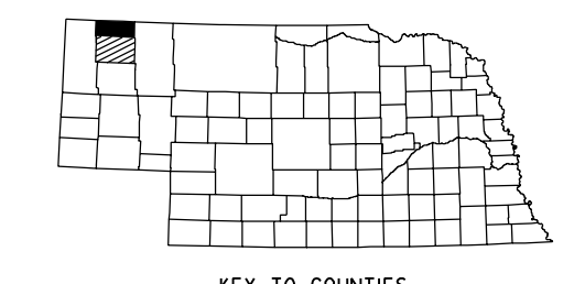
KEY TO COUNTIES

LAMBERT CONFORMAL CONIC PROJECTION 1927 NORTH AMERICAN DATUM NEBRASKA COORDINATE SYSTEM-SOUTH ZONE